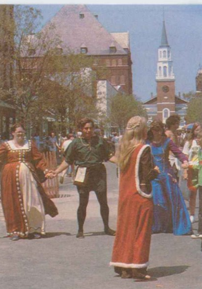
Shakespeare Festival, Burlington

Bienvenue au Vermont! Nous sommes certains que vous serez enchantés par le beau pays de notre état. Les informations que nous vous offrons vous aideront à rendre votre séjour encore plus agréable. Tous les voyageurs autres que les citoyens canadiens ou américains DOIVENT détenir un passeport valide au moment de leur entrée en territoire canadien. Les visiteurs doivent avoir un certificat de vaccination contre la rage datant de moins d'un an. Pour de plus amples renseignements, veuillez consulter les renseignements disponibles auprès de votre départ. Vous pouvez joindre les douanes canadiennes à Phillipsburg en appelant: (514) 248-2004. Pour les douanes américaines, appelez: (802) 868-3541.