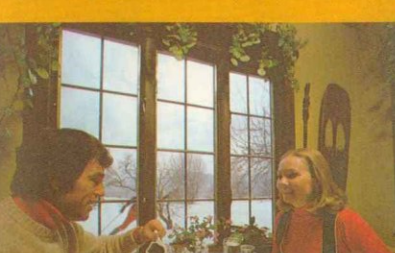
Maple Syrup on pancakes

In 1973, Vermont enacted legislation against throwaway beer and soda containers. The law mandates a minimum 5-cent deposit on every beer and soda can or bottle sold in the state. There's a deposit on all bottles sold in Vermont whether or not labeled, while all cans must be labeled on the top lid. This legislation has been overwhelmingly successful and roadside litter has been dramatically reduced. Visitors are reminded: please return this refund upon receiving your beverage container. Thank you for your cooperation.