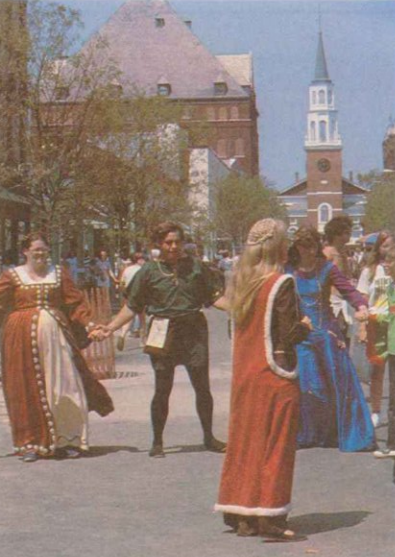
Shakespeare Festival, Burlington

Bienvenue au Vermont! Nous sommes certains que vous serez enchantés par le beau pays de notre état. Les informations que nous vous offrons vous aideront à rendre votre séjour encore plus agréable. Tous les voyageurs autres que les citoyens canadiens ou américains DOIVENT détenir un passeport valide au moment de leur entrée en territoire canadien. Les citoyens doivent avoir un certificat de vaccination contre la rage avant de partir. Pour plus d'informations, consultez les renseignements disponibles auprès de votre délégué. Vous pouvez joindre les douanes canadiennes à Phillipsburg en appelant: (514) 248-2004. Pour les douanes américaines, appelez: (802) 868-3541.