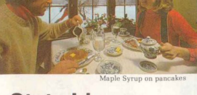
Maple Syrup on pancakes

In 1973, Vermont enacted legislation against three-way beer and soda containers. The law mandates a minimum 5-cent deposit on every beer and soda can or bottle sold in the state. There's a deposit on all bottles sold in Vermont whether or not labeled, while all cans must be labeled on the top lid. This legislation has been overwhelmingly successful and roadside litter has been dramatically reduced. Visitors are reminded: please return this refund upon receiving your beverage container. Thank you for your cooperation.