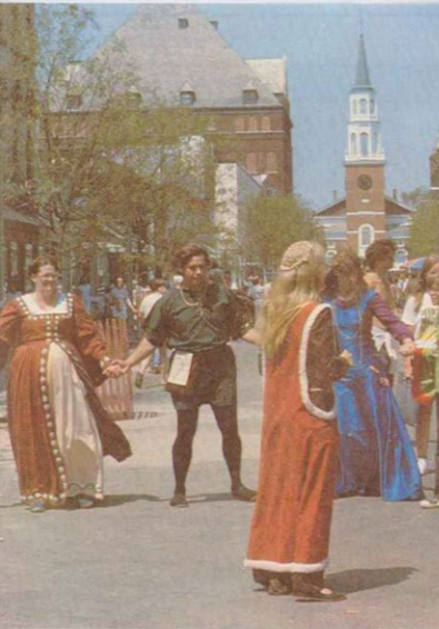
Shakespeare Festival, Burlington

Bienvenue au Vermont! Nous sommes certains que vous serez enchantés par la beauté de notre état. Les informations ci-dessous vous aideront à rendre votre séjour encore plus agréable. Tous les voyageurs étrangers qui les citoyens canadiens ou américains DOIVENT détenir un passeport muni d'un visa de tourisme; dans certains cas, ces visiteurs peuvent avoir à remplir un formulaire d'arrivée et de départ. Vous n'êtes pas autorisé à apporter avec vous des plantes, des racines, et les chiens doivent avoir un certificat de vaccination contre la rage avant d'entrer au Vermont. Pour de plus amples renseignements, veuillez consulter les règlements douaniers avant votre départ. Vous pouvez joindre les douanes américaines par téléphone au 800-368-5848. Pour de plus amples renseignements, veuillez consulter les règlements douaniers avant votre départ. Vous pouvez joindre les douanes américaines par téléphone au 800-368-5848. Pour de plus amples renseignements, veuillez consulter les règlements douaniers avant votre départ. Vous pouvez joindre les douanes américaines par téléphone au 800-368-5848.