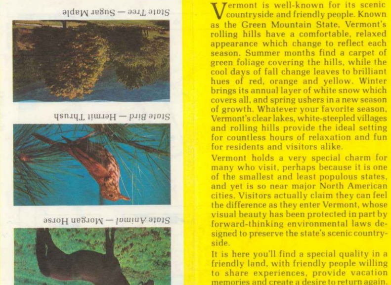
State Tree — Sugar Maple State Bird — Hermit Thrush State Animal — Morgan Horse State Flower — Red Clover