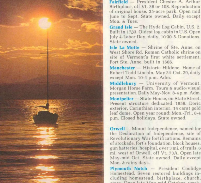
State Symbols Vermont 1980/81 Official State Map

Travel Information System ATTENTION TRAVELERS! Vermont has preserved the natural beauty of its countryside by eliminating all billboards. You will find the following alternative sources of information helpful: Unmanned Travel Information Plazas (indicated by a T on this map) contain general state information and a state map. Chambers of Commerce in many communities operate staffed offices or information booths (see listing below). Interstate Rest Area facilities provide travel literature about specific facilities and general state information. Personnel will assist you to the maximum extent possible. Many individual Vermonters and local CB organizations are happy to assist travelers. Generally, Ch. 9 is monitored for travel information and Ch. 9 for emergency. To locate specific facilities in rural areas, look for Official Business Directional Signs which include facility name, distance from sign to facility, and direction. Enjoy your trip!