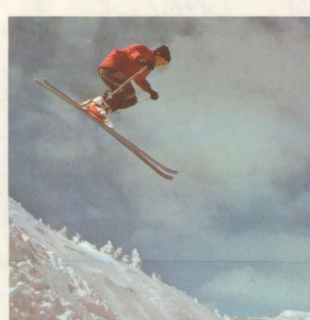
Skier by Clyde H. Smith

In spring, the landscape is all pale fuchsia and lavender buds; there's fishing and late spring skiing and early planting and robins - the air smells clean and good. It's maple sap, syrup, sugar time.