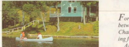
Woodbury Lake by VDA

For much of its 159 mile length, Vermont nestles serenely between the Connecticut River to the East and Lake Champlain to the West. But its soft wooded hills and rolling farmlands can be deceiving, for Vermont has strength. And nowhere is that strength better exemplified than in the Green Mountain Range. Forming a virtually unbroken mountain spine from Canada in the North to the Massachusetts border, the Green Mountains have become a winter and summer playground for travelers and naive Vermonters alike. It is truly the backbone of Vermont.