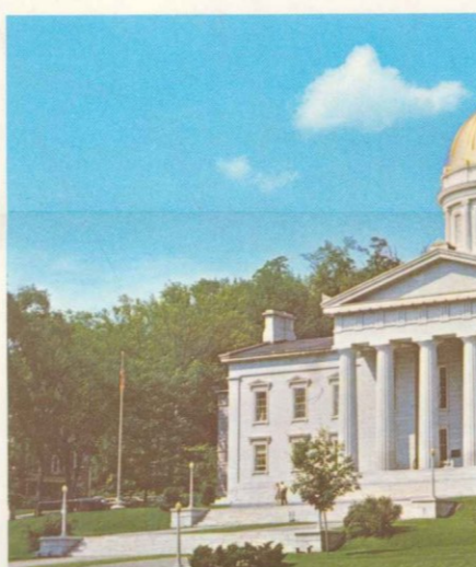
State Capitol, Montpelier

Watershedville - Rev. Dan Foster House. July-Sept., Wed. Sun. 2-5 p.m.