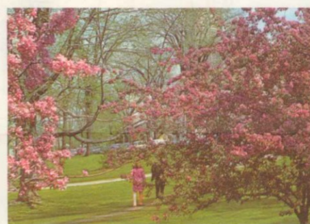
VVM campus, Burlington by Clyde H. Smith

Vermonters are aware of the importance of the state's natural beauty; not only as a major asset to the tourist industry, but as the supportive foundation to their way of life. Vermont is the first state to enact laws eliminating all off-premise outdoor advertising and it leads the country in forward-thinking environmental protection legislation. There is much to be protected.