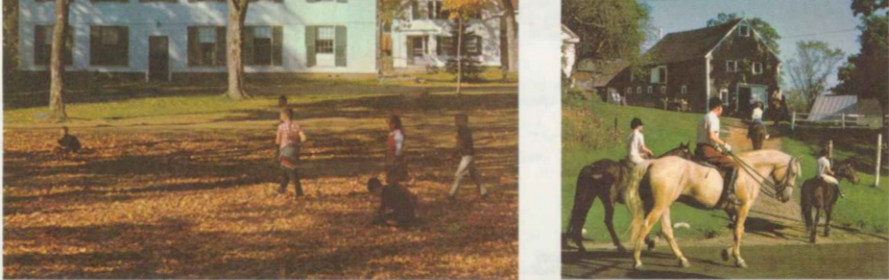
Woodbury Lake, VDA

ART GALLERIES AND SUMMER THEATRES IN VERMONT Sculpture on the Highways. As a result of two international sculpture symposia held in the Green Mountain State, one in 1968—the other in 1971, eighteen marble and concrete sculptures have been placed on Vermont's Interstate Highway system. Strategically located in rest areas, the monumental constructions are found from the Massachusetts to the Canadian borders on I-91 and I-89. ART GALLERIES Deid Hollow Gallery, Montgomery Ctr. Colley Gallery, Manchester Dorset Library—McIntyre Gallery, Dorset Dover Art Gallery, West Dover Four Winds Gallery, Ferrisburgh Gallery 2, Walsfield Gallery 2, Woodstock Great Hill Gallery, Felchville (Reading P.O.) Marlboro Center Gallery, Marlboro Museum Gallery, Moscow Northern Vermont Artists Association, Burlington R. H. Fleming Museum, Burlington Shelburne Museum, Shelburne Southern Vermont Art Center, Manchester Southern Vermont Art Gallery, Manchester Ctr. Springfield Art & Historical Society, Springfield Studio on the Hill, Weston SUMMER THEATRES Bradford Repertory Theatre, Bradford Cabaret Theatre, Marble Island Resort, Colchester Caravan Theatre, Dorset Champlain Shakespeare Festival, Burlington Green Mountain Guild, Stowe Green Mountain Guild, Killington Hayden Theatre, Plainfield Lanslot's City Players, Hyde Park Marlboro Theatre Co., Marlboro The Valley Playhouse, Warren Weston Playhouse, Weston Windham College Summer Repertory Theatre, Putney