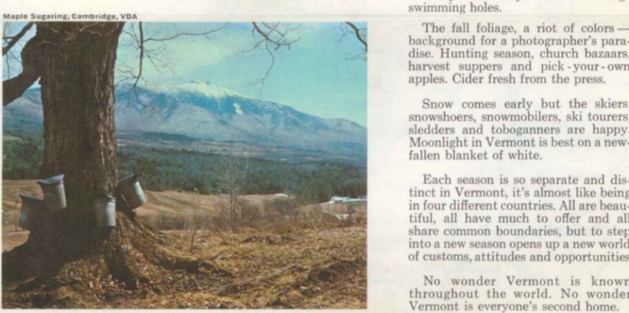
Maple Sugaring, Cambridge, VDA