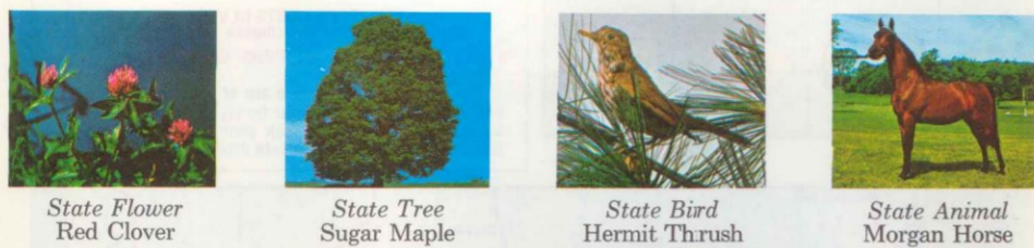
State Flower Red Clover State Tree Sugar Maple State Bird Hermit Thrush State Animal Morgan Horse

Published by the Vermont Department of Highways and the Agency of Development & Community Affairs, Montpelier, Vermont 05602.