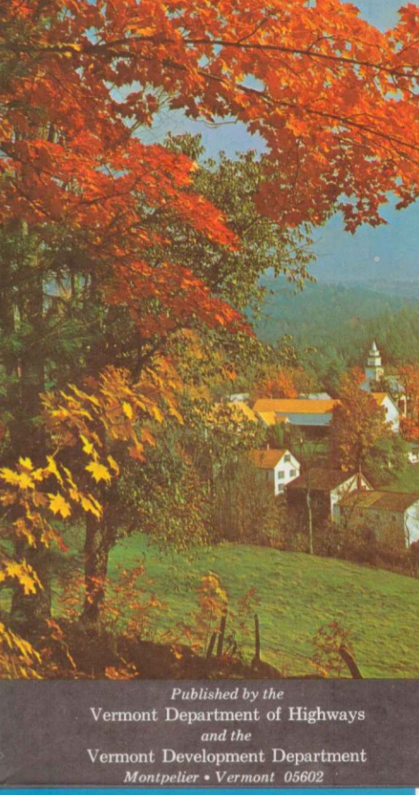
Published by the Vermont Department of Highways and the Vermont Development Department Montpelier • Vermont 05602