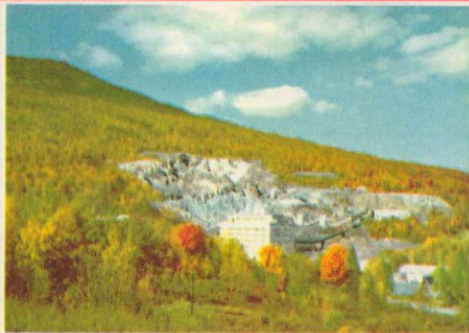
Vermont Asbestos Mines

*From U. S. D. A., B. A. E. and Vermont Department of Agriculture