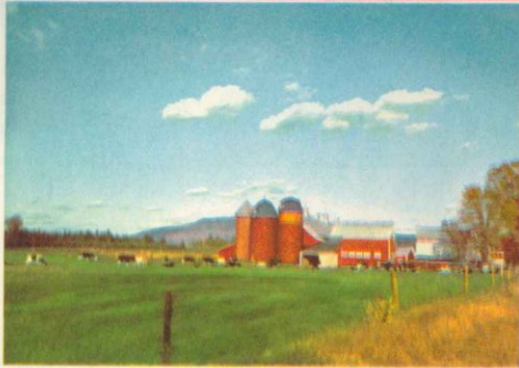
"Chore Time" — Typical Vermont Farm Scene

An efficient State Police Force is ready to help motorists at any time of the day or night.