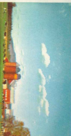
"Chore Time" — Typical Vermont Farm Scene

GREEN MOUNTAIN LAND lies within reasonable driving distance of the large population centers of the EAST — Boston, Providence, Hartford, New York, Philadelphia, Buffalo, Ottawa, Montreal, etc. It is a main gateway to New England from points to the North and to the West.