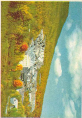
Vermont Asbestos Mines

Neat farms and villages bear witness that living is good in this rural area. Vermont has been called not a state but a "Way of Life." It is true that most Vermonters enjoy all the benefits of country life with modern conveniences. Throughout Vermont the traveler will find hospitable hotels, motels, tourist homes and roadside cabins. These are all subject to a unique sanitary inspection by the State Department of Health. Also there are hundreds of house-keeping cabins for rent, mostly along lake shores.