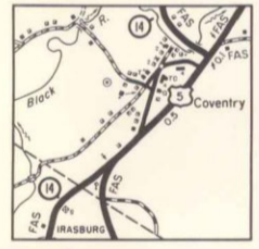
INSET 4 COVENTRY