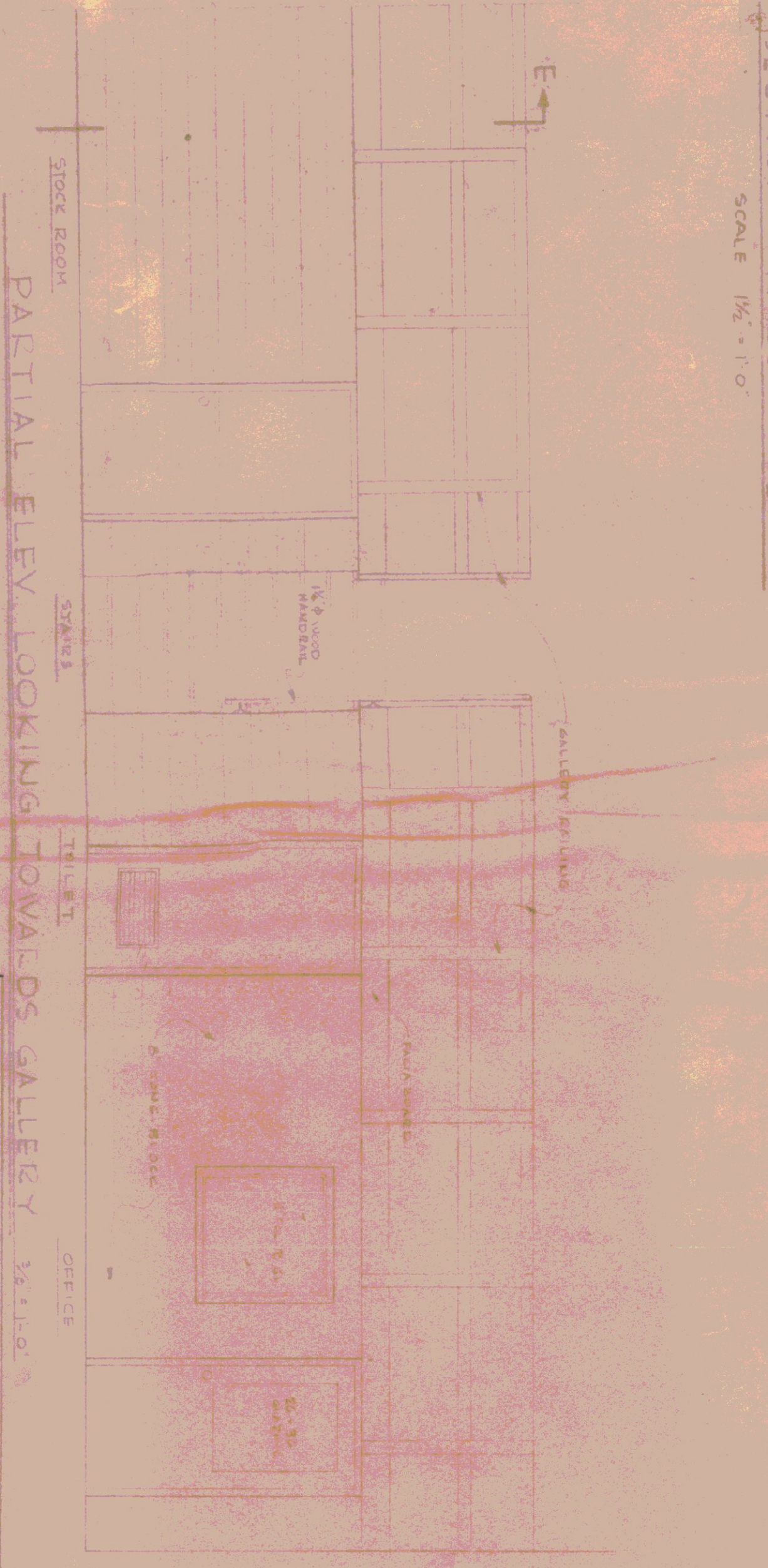
PARTIAL ELEV. LOOKING TOWARDS GALLERY

NOTES: ALL DOORS AND DOOR FRAMES TO BE HOLLOW METAL. ALL GLASS TO BE POL. R GLASS. FOR FRAME DETAILS SEE ELSEWHERE ON THIS SHEET