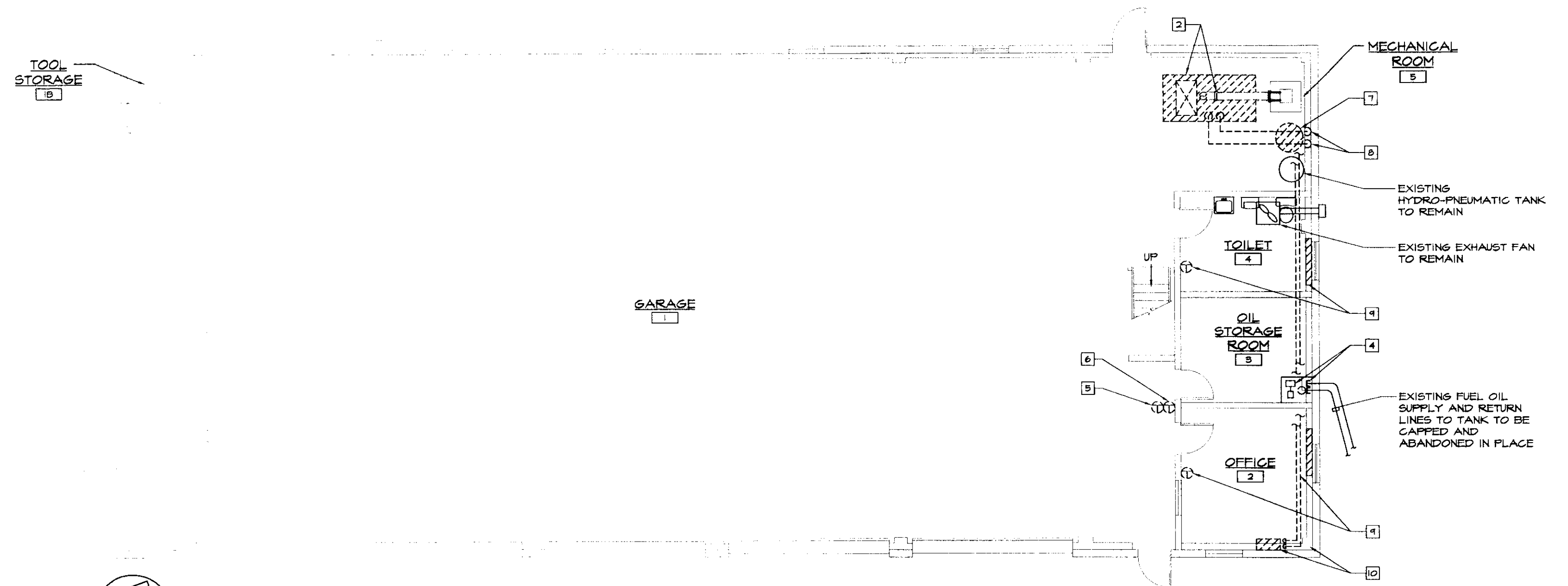
MAIN FLOOR PLAN - MECHANICAL DEMOLITION SCALE: 1/4"=1'-0"

X:\03122\Drawings\Mech\03122M01.dwg, M1, 7/7/2005 8:44:19 AM, © LANE ASSOCIATES CONSULTING ENGINEERS, P.C. 2005