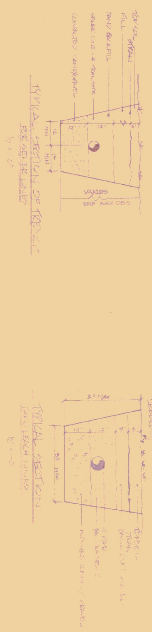
SECTION A - THROUGH LEACHING FIELD