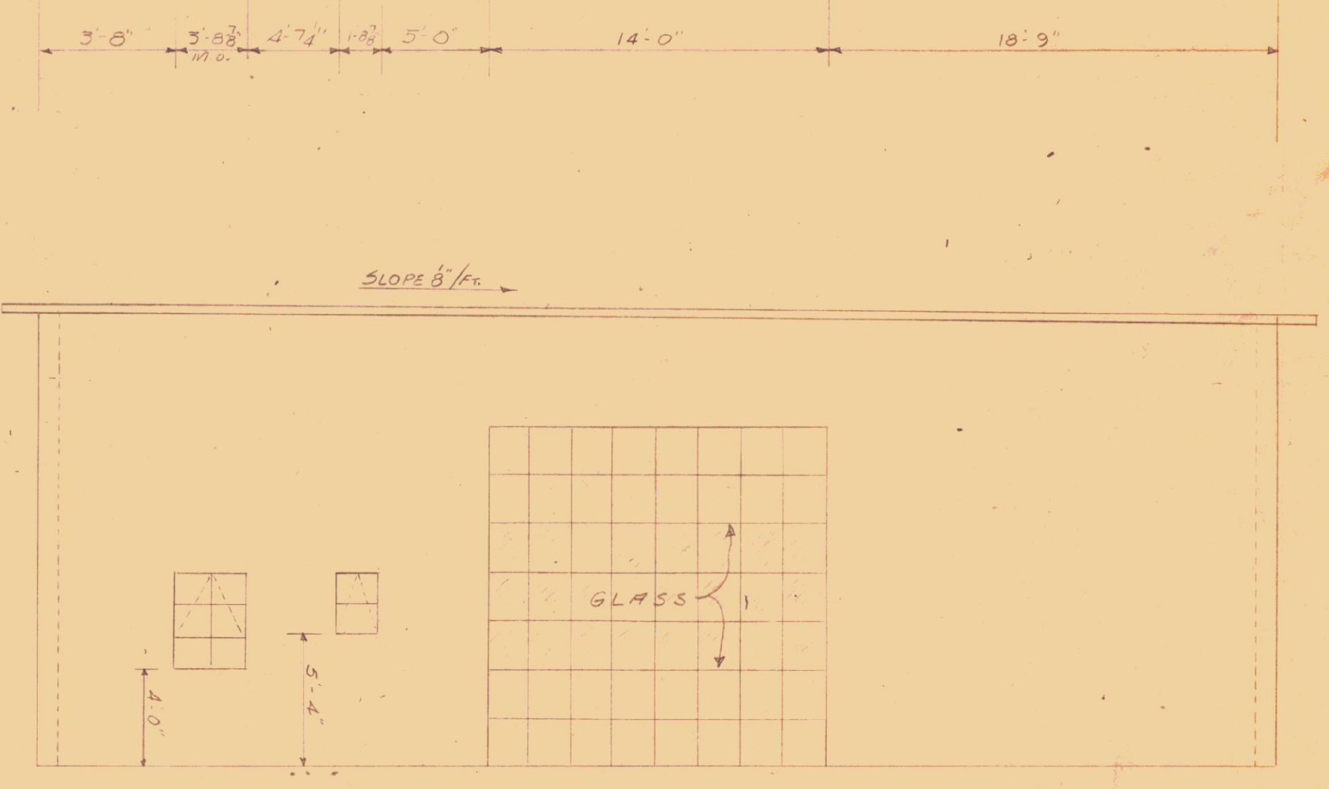
END ELEVATION SCALE 1/8"