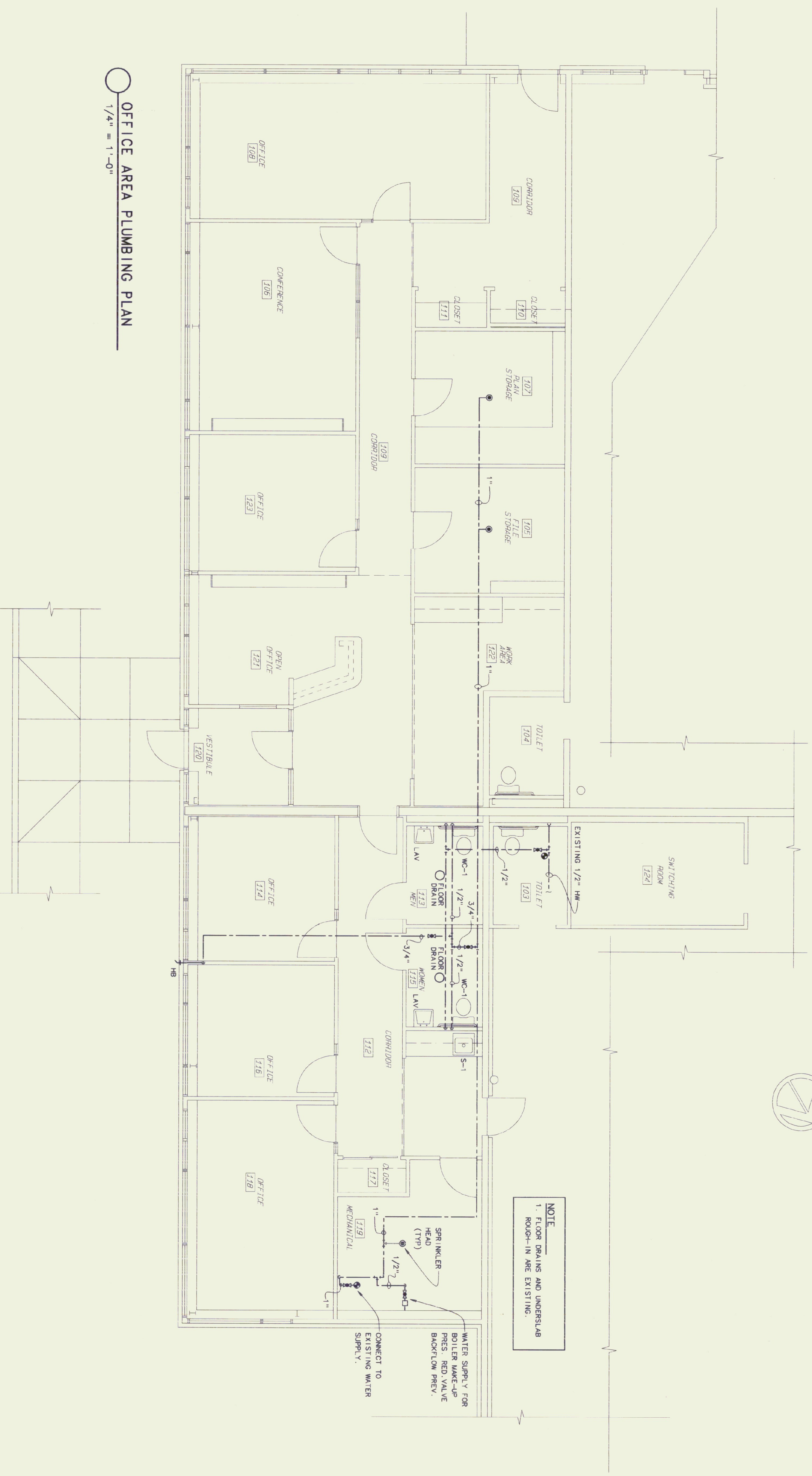
OFFICE AREA PLUMBING PLAN 1/4" = 1'-0"