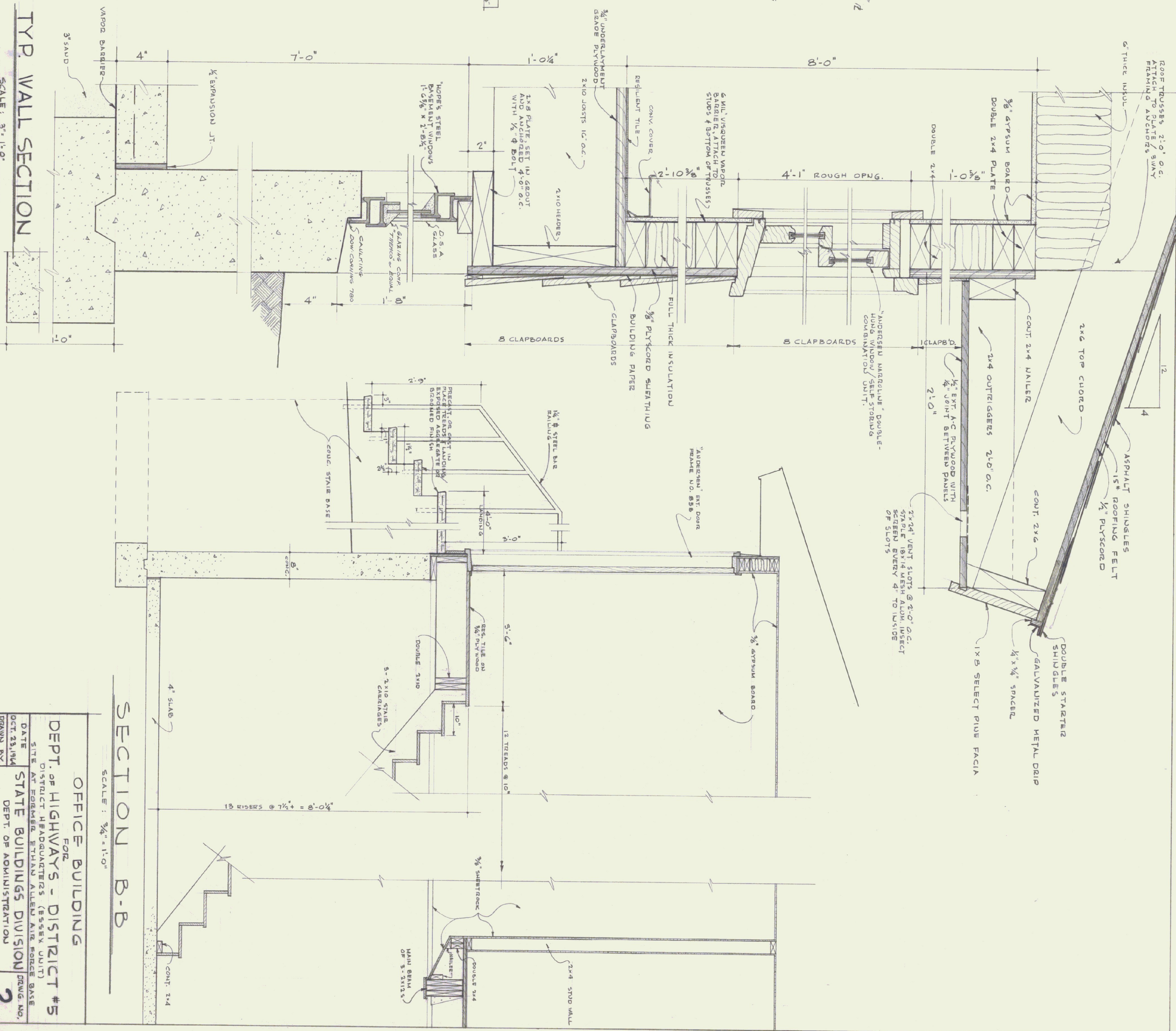
SECTION B-B SCALE: 3/8" = 1'-0"