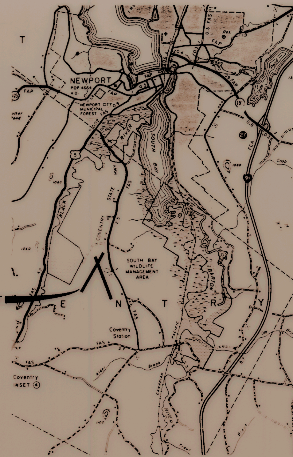
VICINITY MAP 1" = 1 MILE