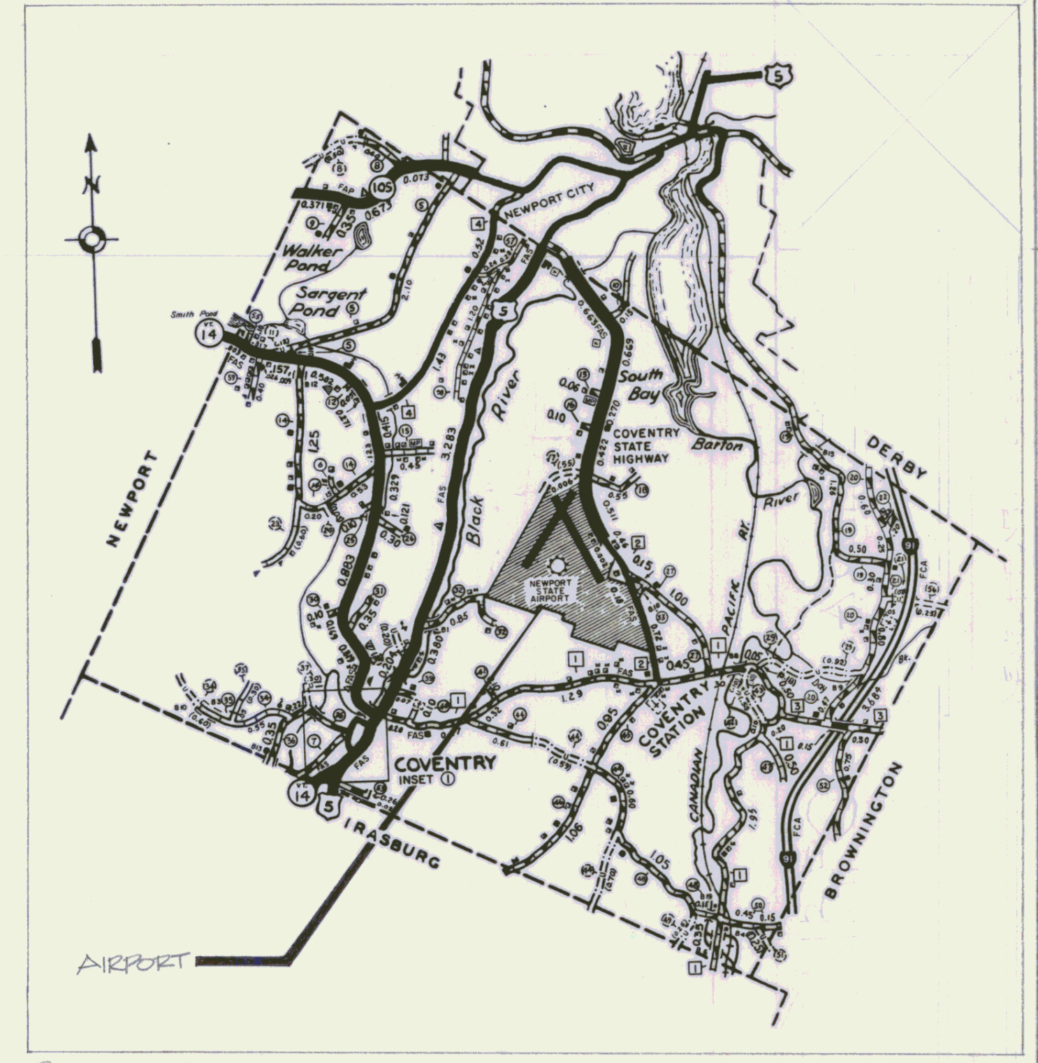
PROJECT LOCATION MAP - N.T.S.