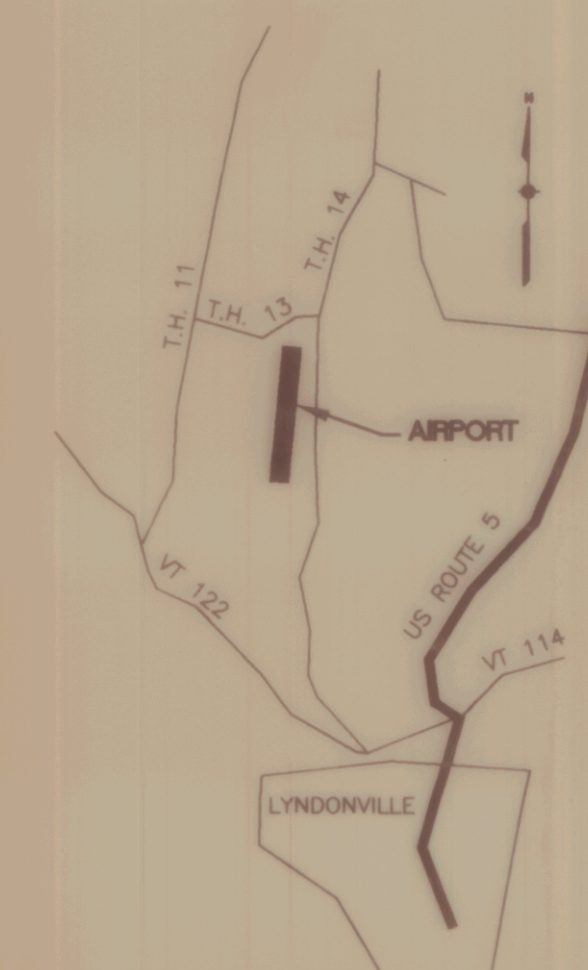
VICINITY MAP SCALE: 1" = 1 MILE