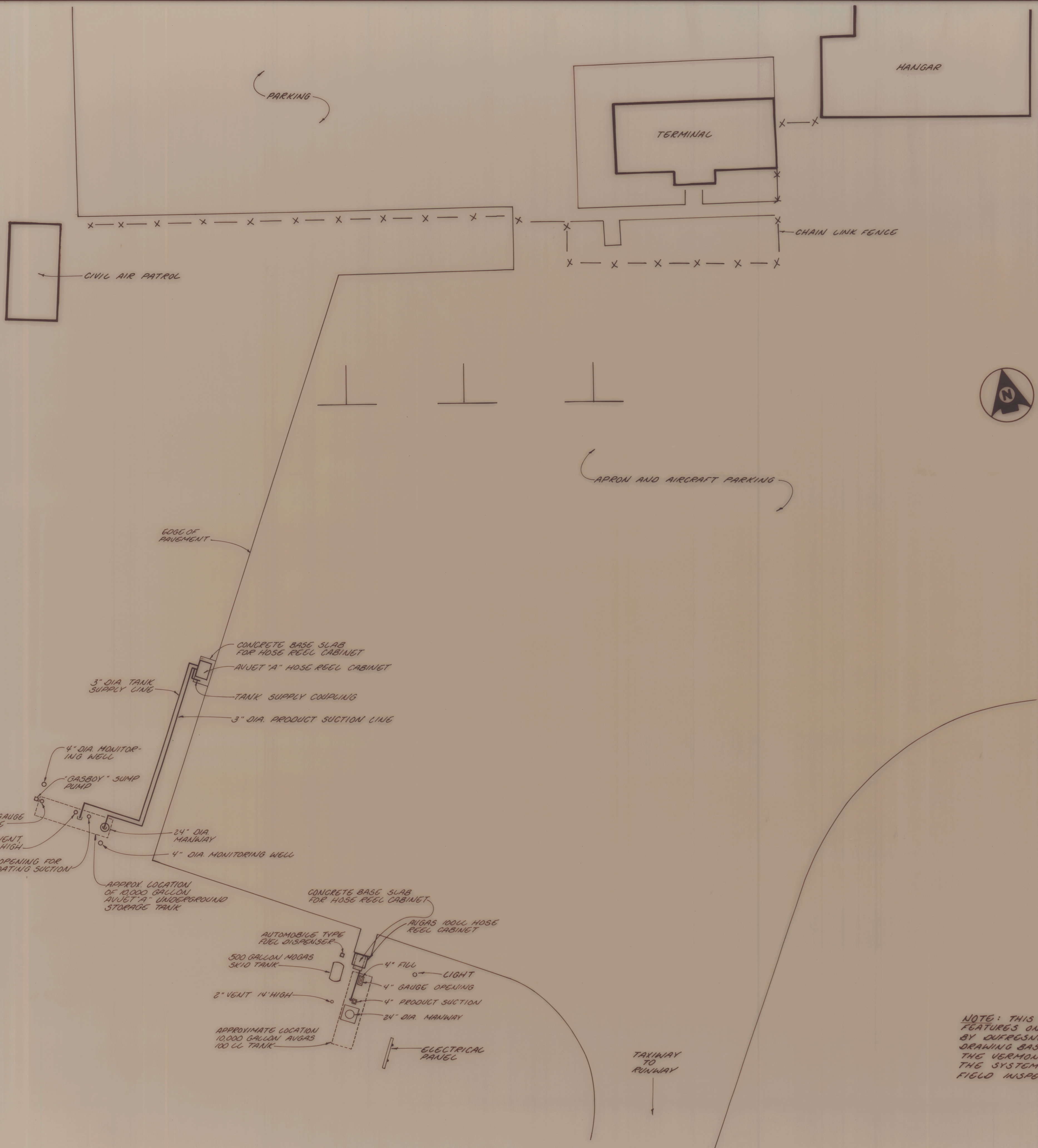
SITE PLAN 1" = 20'