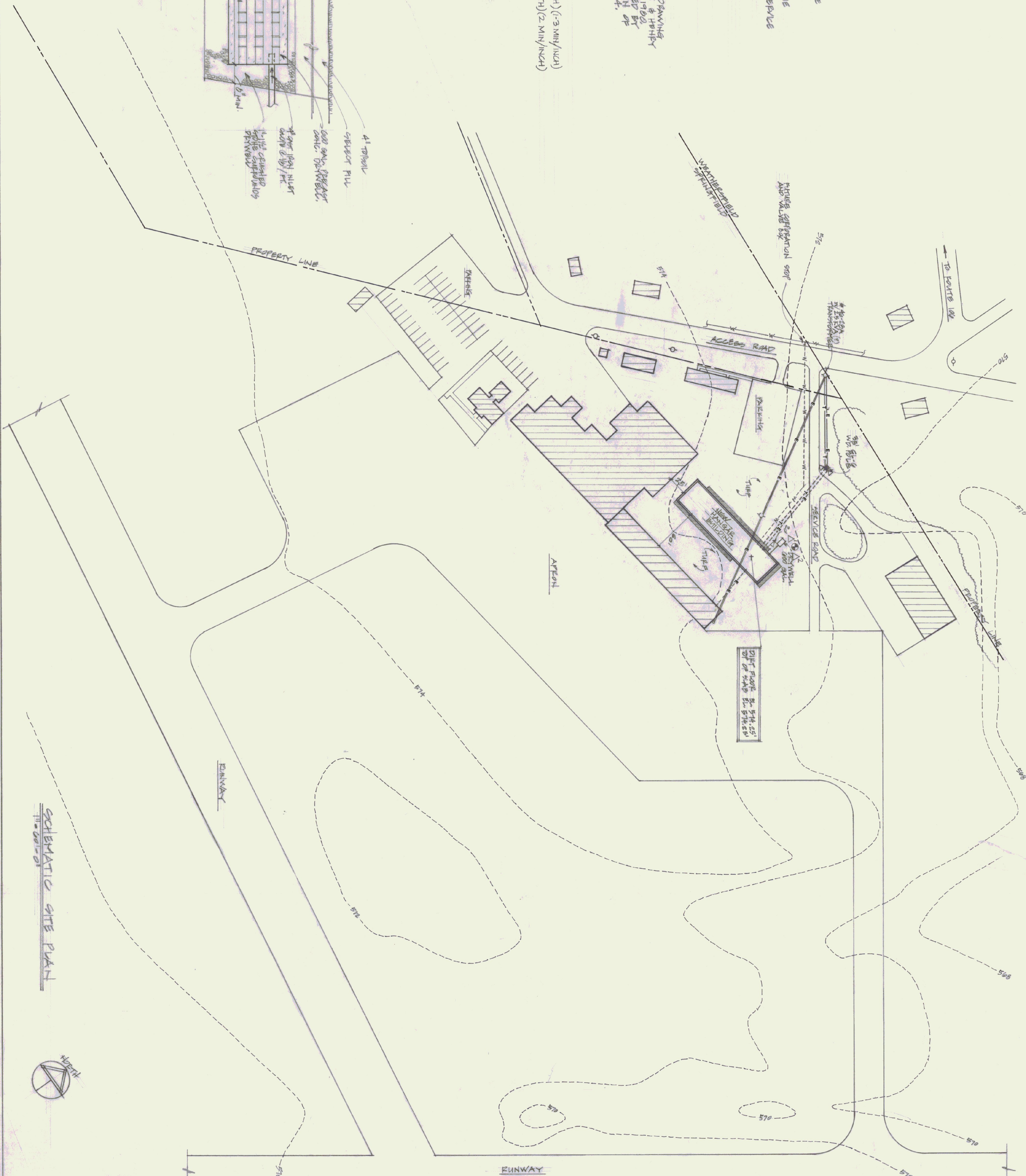
SCHEMATIC SITE PLAN