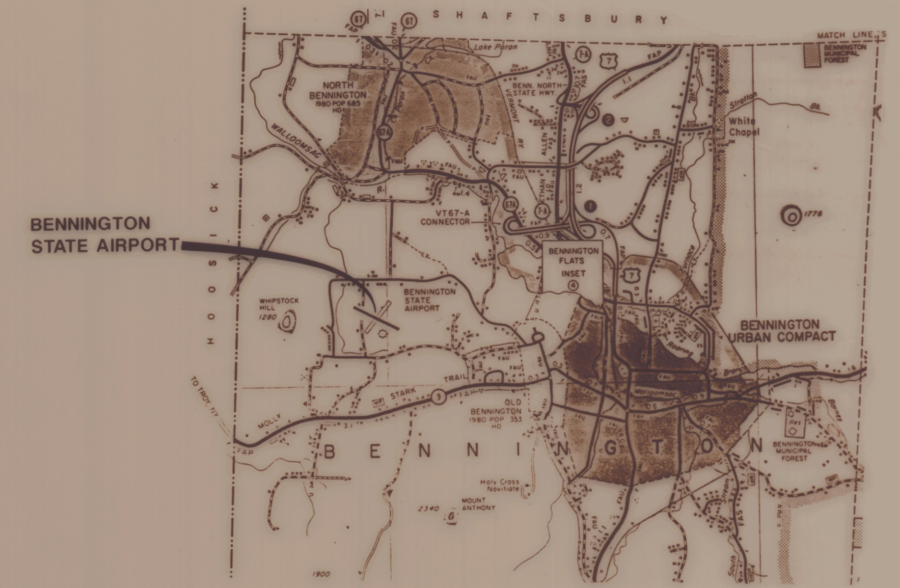
VICINITY MAP 1" = 1 MILE