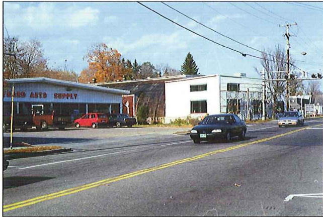
LOOKING TO SW QUADRANT