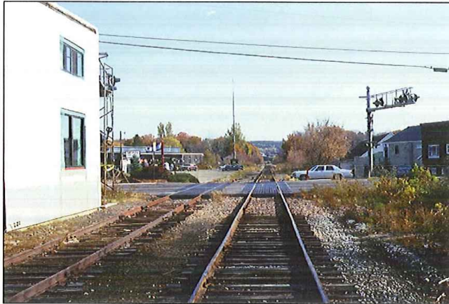
LOOKING EAST MAINLINE ON RIGHT SIDE