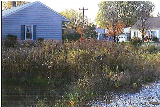
SE QUADRANT FROM RAILROAD