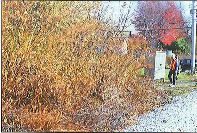
NW QUADRANT FROM RAILROAD