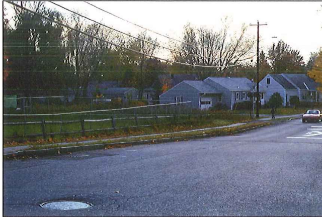
LOOKING TO NE QUADRANT