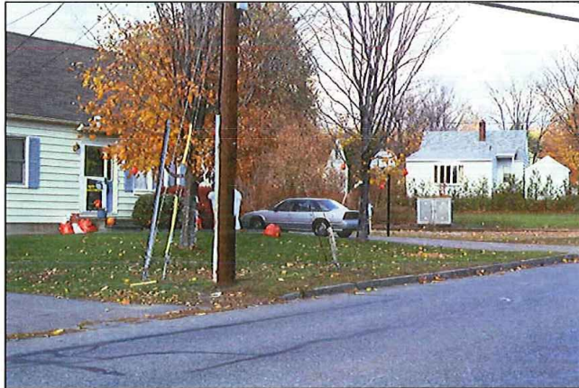
LOOKING TO SW QUADRANT