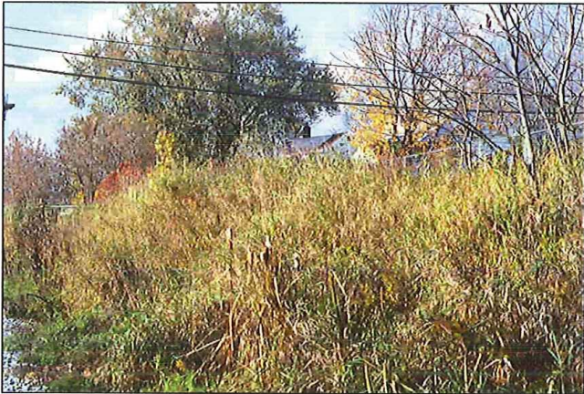
NE QUADRANT FROM RAILROAD