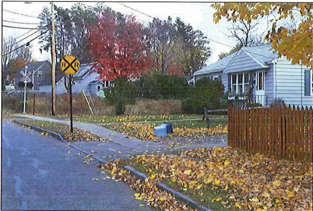
LOOKING TO SE QUADRANT