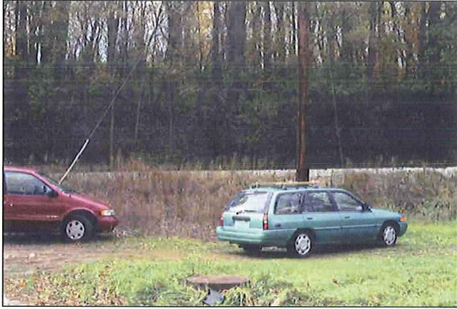
LOOKING TO SE QUADRANT