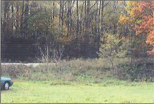
LOOKING TO SE QUADRANT