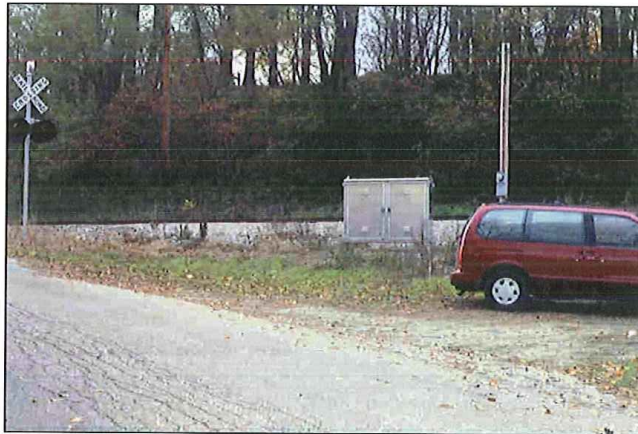
LOOKING TO SE QUADRANT