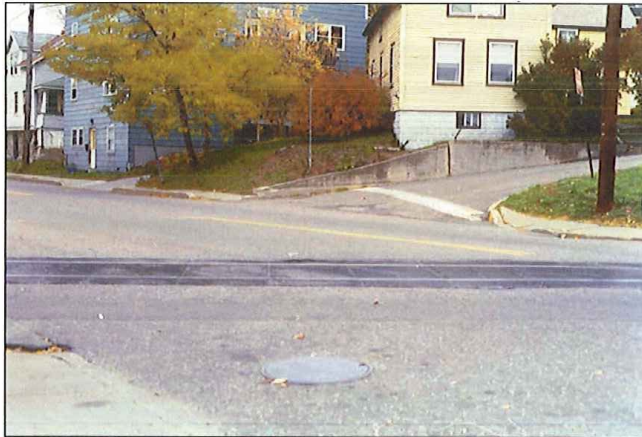
LOOKING NORTH FROM SW SIDEWALK TO NE QUADRANT