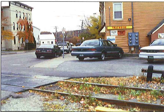
SW QUADRANT PARKING LOT WITH EXIT AT CROSSING