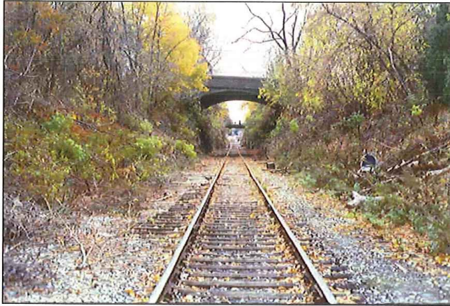
RAILROAD CUT EAST OF MALLET'S BAY AVENUE CROSSING