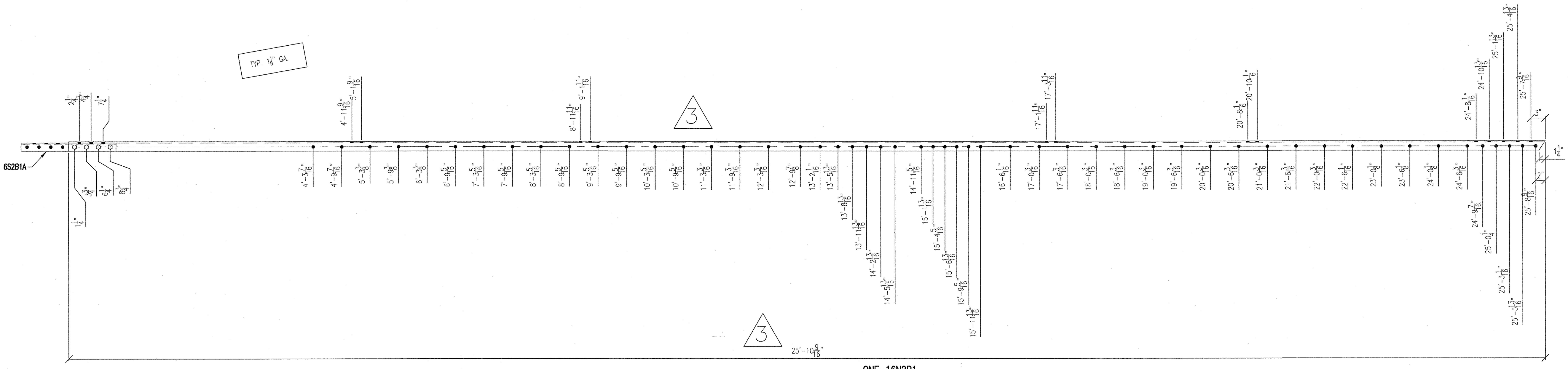
ONE-16N2B1 MATCH EXISTING R MRK'D "N2B1"