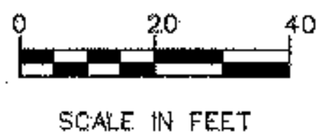
SCALE IN FEET