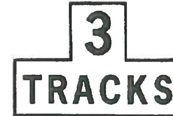
3368-710-C Reference F