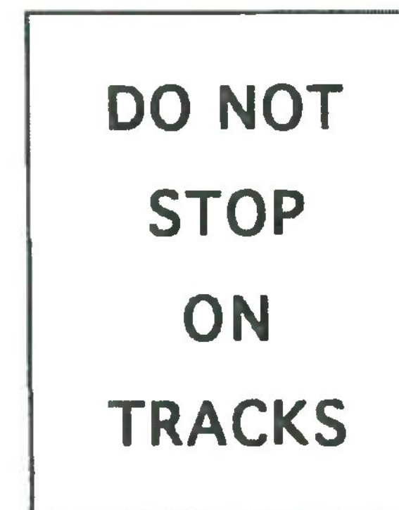
SE-1781 Reference L