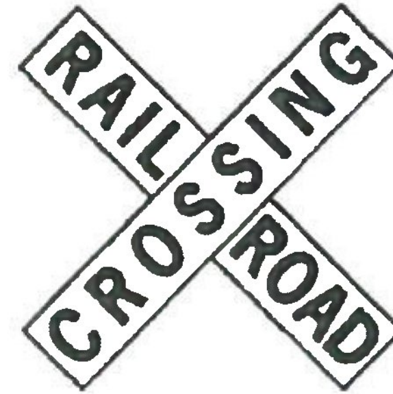
3380-710 Reference A