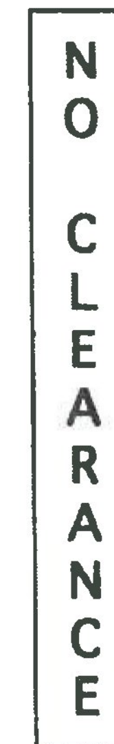
3385-100 Reference Q