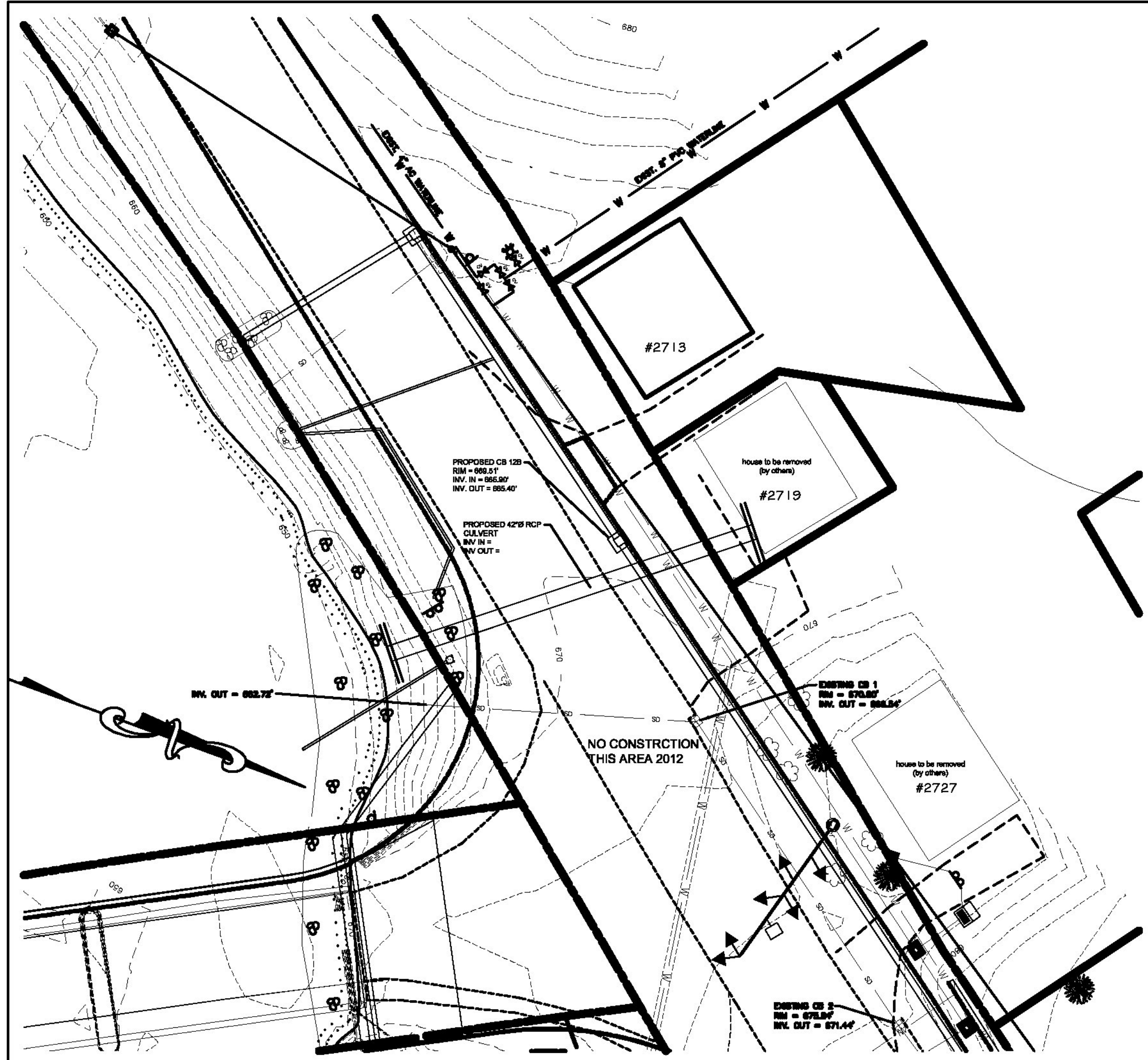
SITE PLAN - AREA 'A' SCALE" 1" = 20'