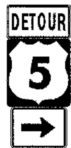
US 5 DETOUR RIGHT (SDR)