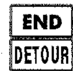
END DETOUR (ED)