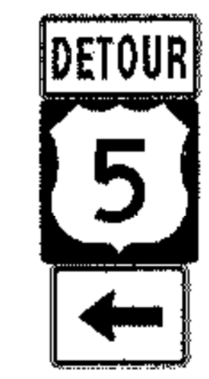
US 5 DETOUR LEFT (5DL)