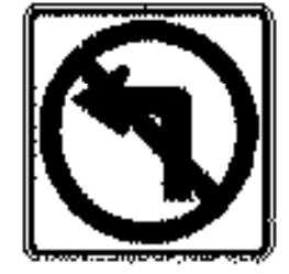
NO LEFT TURN (NLT)