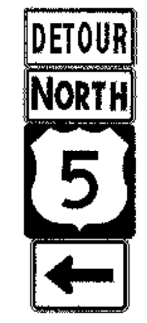
NORTH US 5 DETOUR LEFT (N5DL)