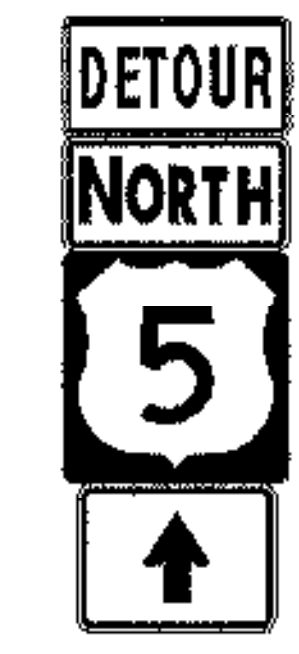
NORTH US 5 DETOUR (N5D)