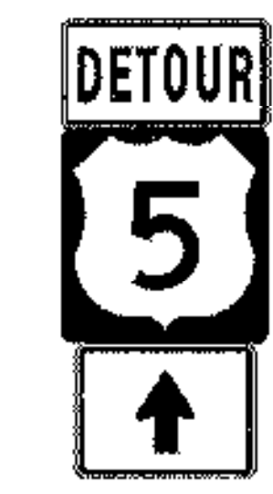
US 5 DETOUR (5D)