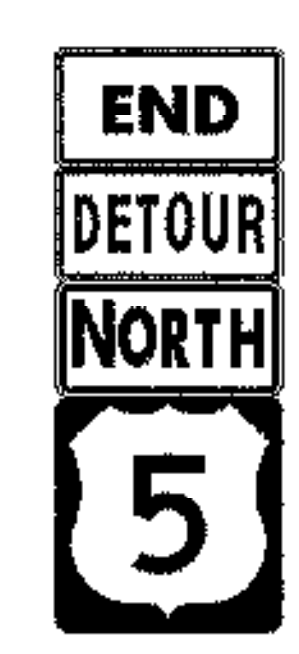
NORTH US 5 END DETOUR (N5ED)