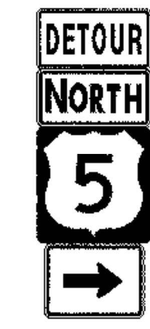
NORTH US 5 DETOUR RIGHT (N5DR)