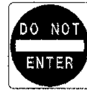
DO NOT ENTER (DNE)