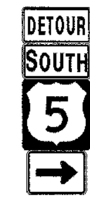
SOUTH US 5 DETOUR RIGHT (S5DR)