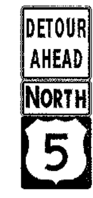
DETOUR AHEAD NORTH US 5 (DA5N)