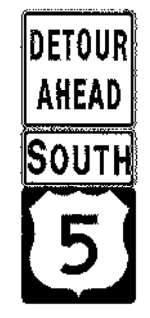
DETOUR AHEAD SOUTH US 5 (DA5S)