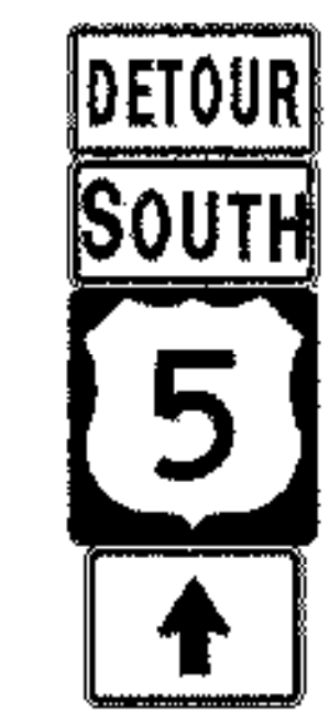
SOUTH US 5 DETOUR (S5D)