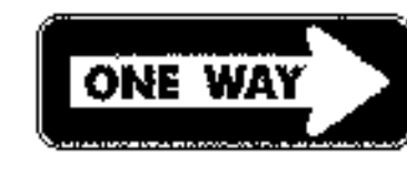
ONE WAY RIGHT (OWR)