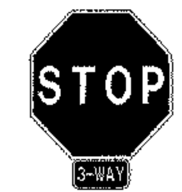
STOP W/ 3-WAY PLAQUE (S3W)