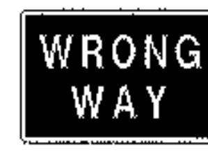
WRONG WAY (WW)