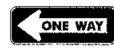
ONE WAY LEFT (OWL)