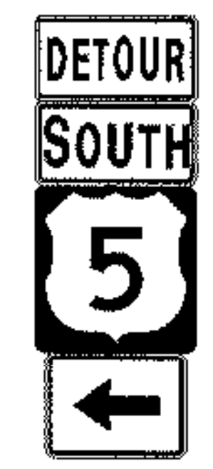
SOUTH US 5 DETOUR LEFT (S5DL)