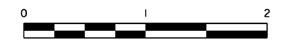
SCALE = 1:20

ALL LAPS ARE 660 MIN UNLESS OTHERWISE SPECIFIED ON THE PLANS.