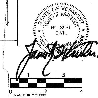
GEOPIER LOCATION PLAN SCALE: 1:20

DESIGN/BUILD GEOTECHNICAL 12 Mount Royal Ave., Ste. 208 Warborough, MA 01752 Tel: 508-481-3849 Fax: 508-460-1114 "DELIVERING THE GEOPIER FOUNDATION SYSTEM"