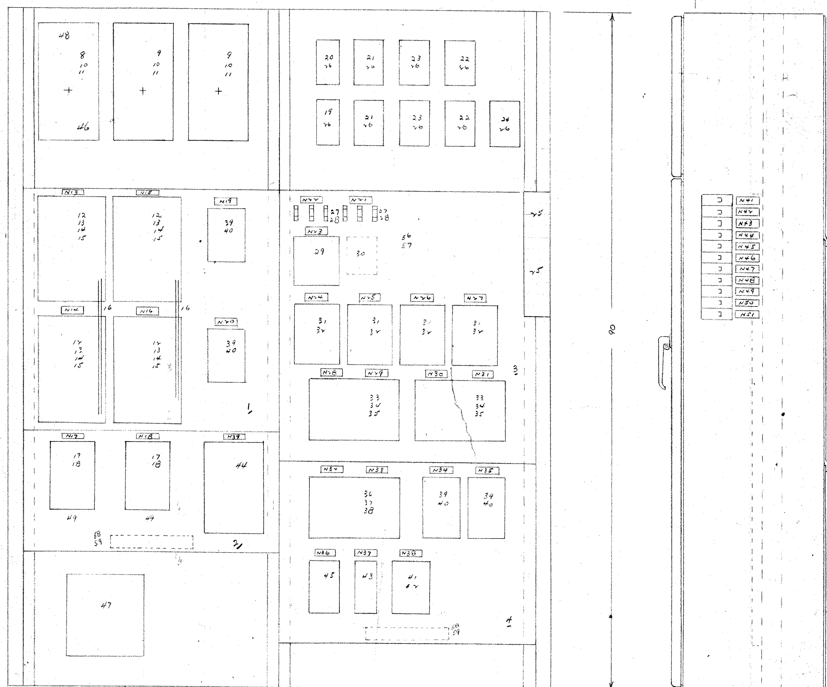
FRONT VIEW - SECTION A-A - SHOWING DOORS & BREAKER COVERS REMOVED