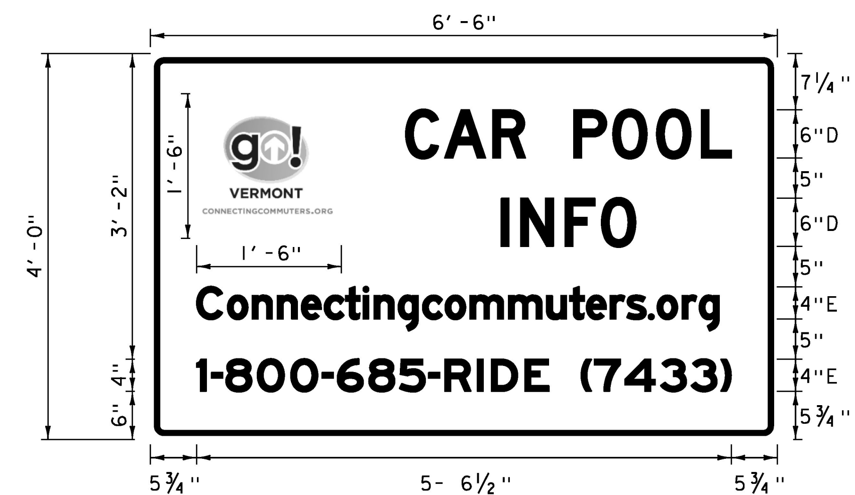
SIGNAGE DETAIL 1 NOT TO SCALE

WHITE BORDER AND TEXT (RETROFLECTIVE) BLUE BACKGROUND (RETROFLECTIVE) SEE VAOT STANDARD T-2