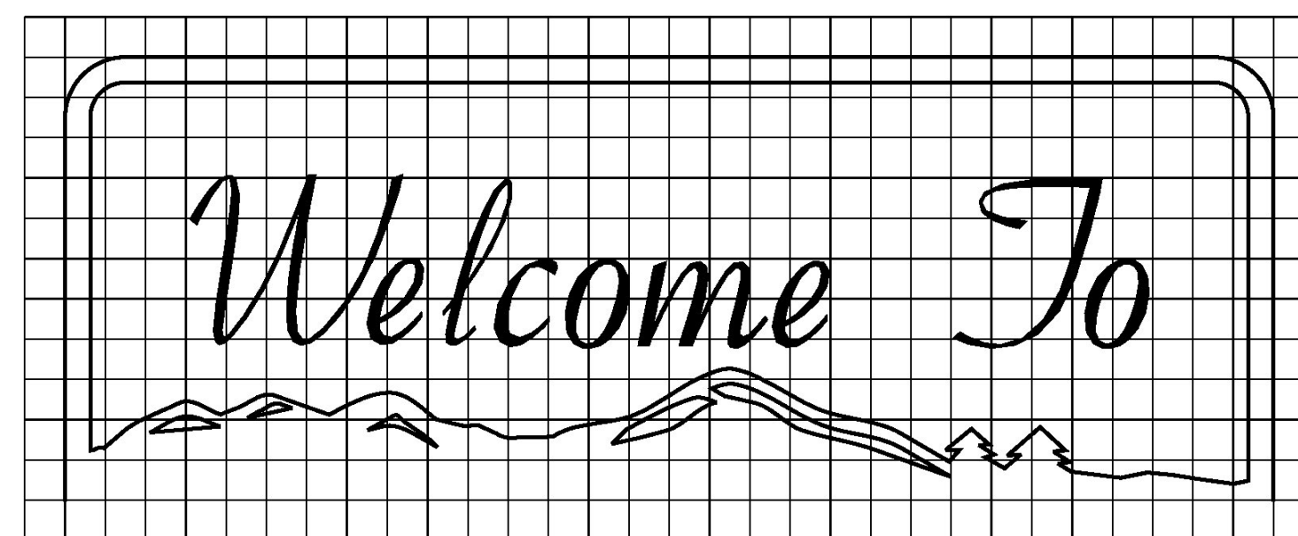
1 BLOCK = 1" X 1"

NOTE: FOR THE WORDS "WELCOME TO" USE GERBER FONT MURRAY HILL BOLD OR EQUIVALENT. TEXT COLOR IS GREEN. ALL OTHER TEXT USE GERBER FONT SOUVENIR DEMIBOLD OR EQUIVALENT. TEXT COLOR IS WHITE. REFER TO STD. E-131 FOR COLORS.