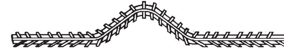
P-59 Swift Lift Shear Bar 1-Ton and 8-Ton

Dayton Superior Swift Lift Shear Bars (P-59) are utilized when edge lifting precast elements. The shear bar is secured tightly to the recess plug and at the time of lift helps to transfer the shear load deeper into the concrete. The P-59 Smooth Wire Shear Bar is designed to snap into the built-in clips on the P-54 recess plug. The standard shear bar is fabricated from rebar and must be securely wired tightly to the Swift Lift recess plugs.