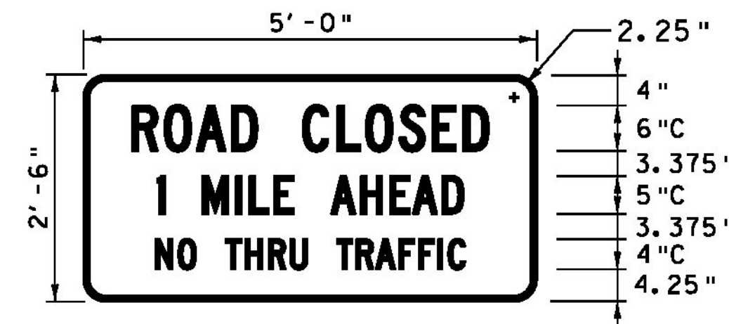
SP-4 NOT TO SCALE

NOTE: COLORS FOR THE SP-4 SIGN SHALL BE BLACK TEXT AND BORDER ON RETROREFLECTIVE FLORESCENT WHITE BACKGROUND. TWO ORANGE FLAGS (ONE EACH SIDE) SHALL BE PLACED AT THE TOP OF THE SP-2 SIGNS. BORDER SHALL BE 0.075" AND INDENT SHALL BE 0.50".