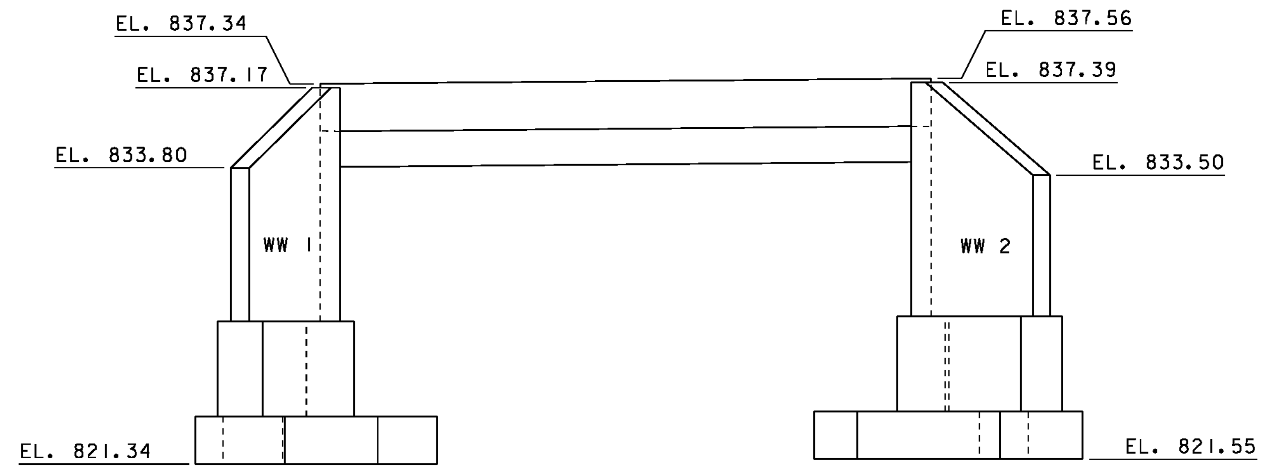
INLET ELEVATION SCALE: 1/4" = 1'-0"