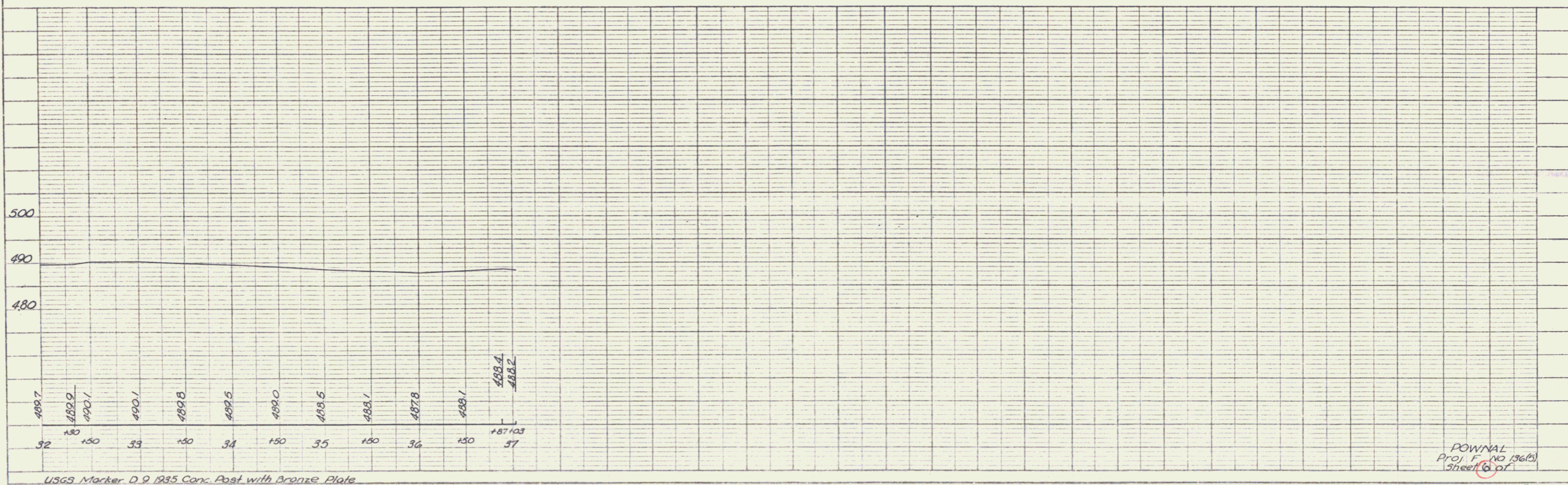
USGS Marker D 9 1935 Conc. Post with Bronze Plate 22° 21' Sta. 36+67 Elev 487.22

PROFILE DATE 1/86 PROJECT L'Plat DRAWN BY [illegible] CHECKED BY [illegible] NO. OF SHEETS 1