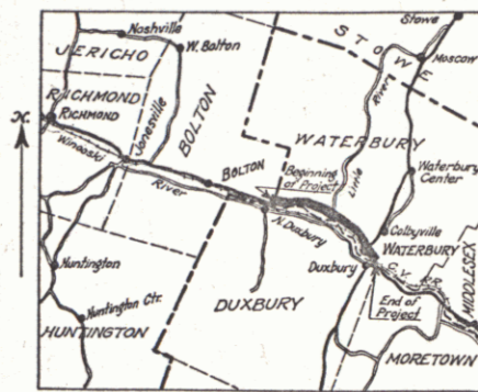
SCALE - 1 INCH = 4 MILES