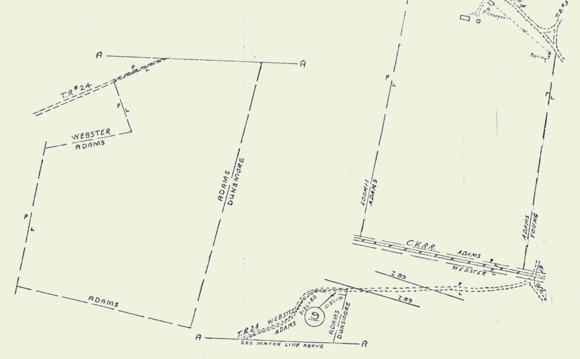
400' Approx Scale in ft.

WILLIAM J. & LOUISE ADAMS I-89-3(28) PARCEL # 9 TOTAL ACREAGE 225.0A± TAKING 0.35A± REMAINING 224.65A± LOSS of ACCESS 0.0A±