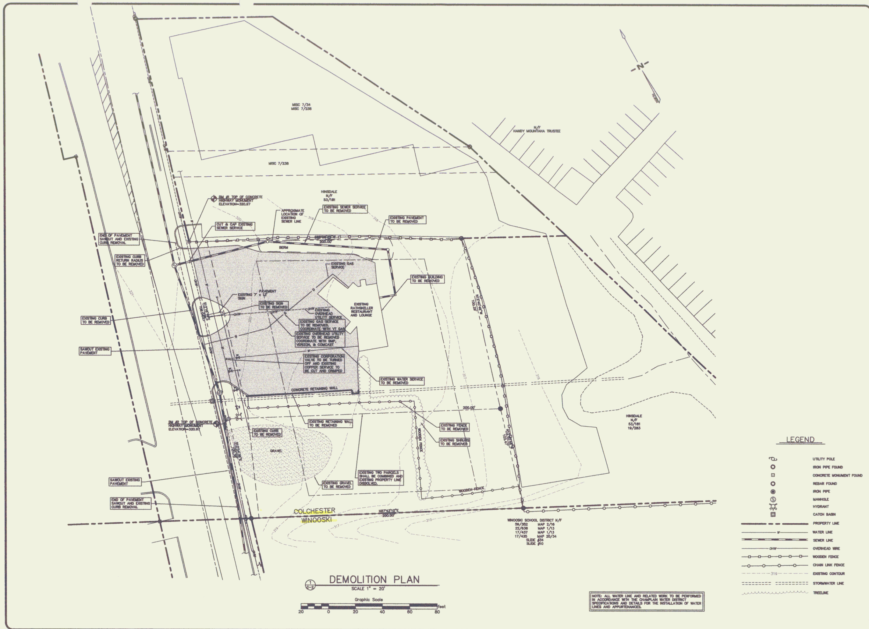
DEMOLITION PLAN SCALE 1" = 20' Graphic Scale 0 20 40 60 80 feet

NOTE: ALL WATER LINE AND RELATED WORK TO BE PERFORMED IN ACCORDANCE WITH THE CHAMPLAIN WATER DISTRICT SPECIFICATIONS AND DETAILS FOR THE INSTALLATION OF WATER LINES AND APPURTENANCES.