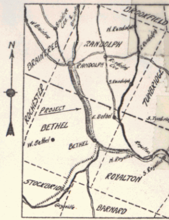
SCALE 1/4" = 1 MI.

LENGTH OF PROJECT 32065.3 FT. = 6.072 MI.