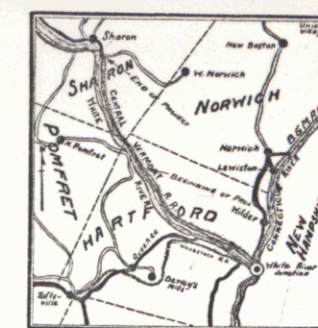
SCALE: 1" = 4 MILES

PLAN 1 INCH = 50 FEET PROFILE HOR. - 1 INCH = 50 FEET VERT. - 1 INCH = 10 FEET CROSS-SECTIONS - 1 INCH = 5 FEET