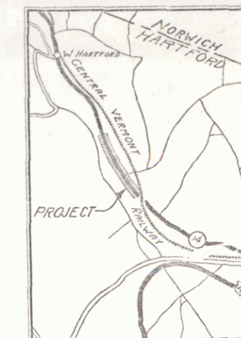
SCALE: 1 INCH = 1 MILE