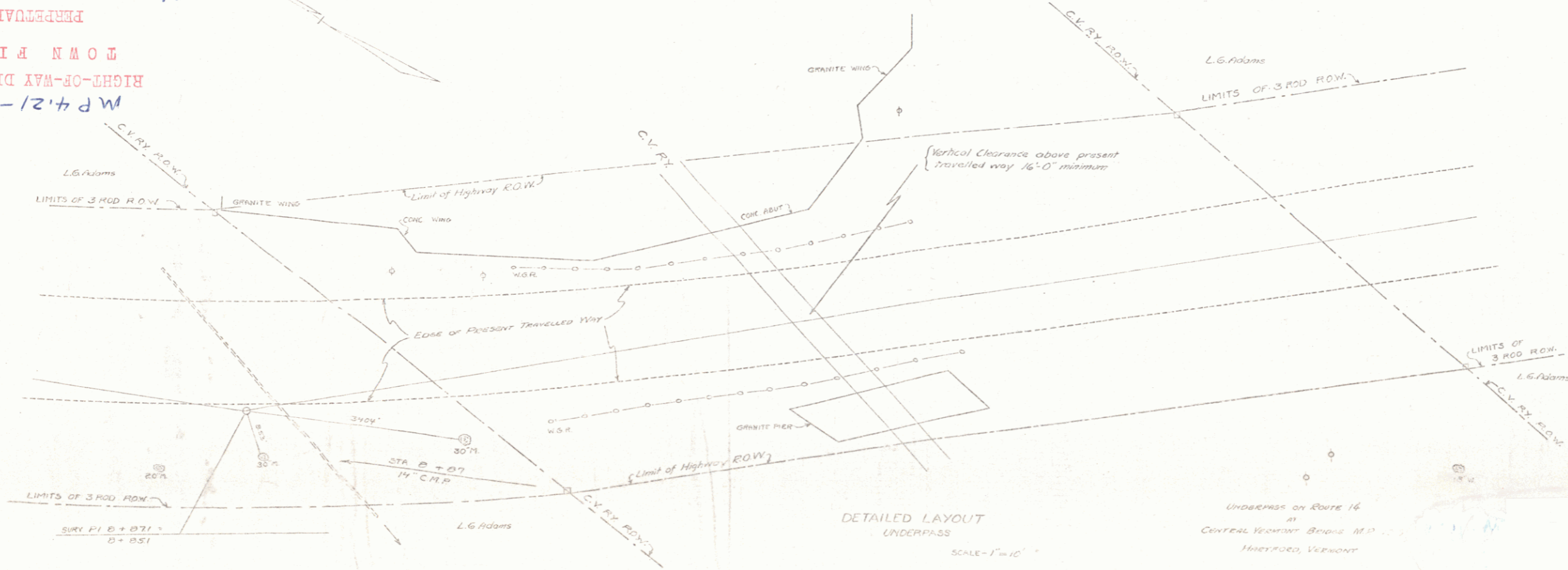
DETAILED LAYOUT UNDERPASS SCALE 1" = 10'

(To Be Returned To R.O.W. Division) PERPETUAL TOWN FILE HIGHWAY DIVISION M.P. 4.21 - 4.48 0+14