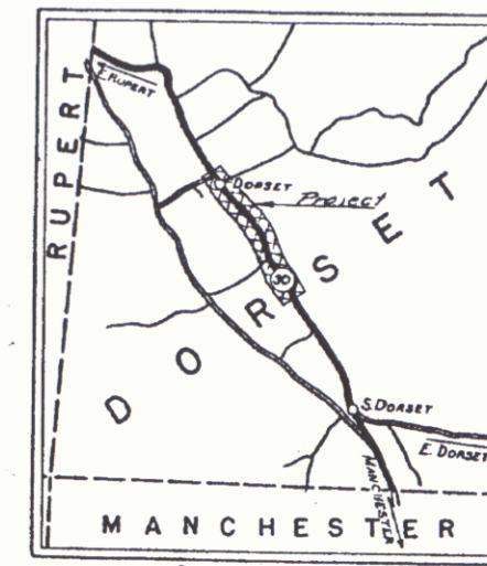
Scale: 1 inch = 1 Mile

LENGTH OF PROJECT 7624.7 FT. = 1.444 MI.