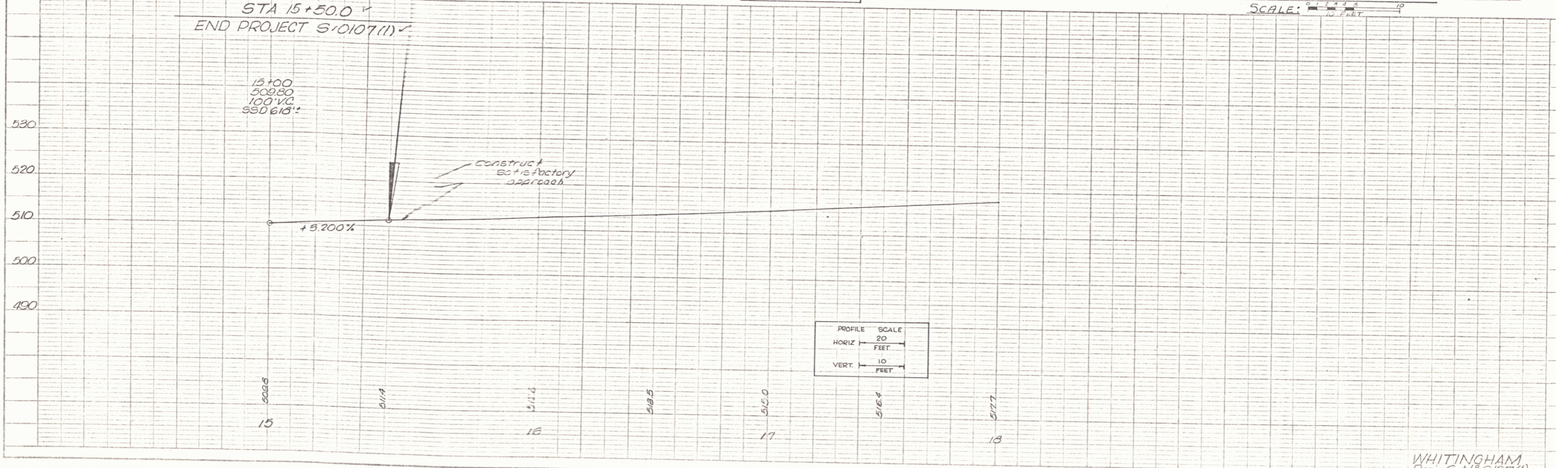
BORING DETAILS SCALE: 1" = 10'

PLATE 1 - PLAN - PROFILE OF BRIDGE APPROACH PROJECT: 15100-15128 DATE: 12-28-58